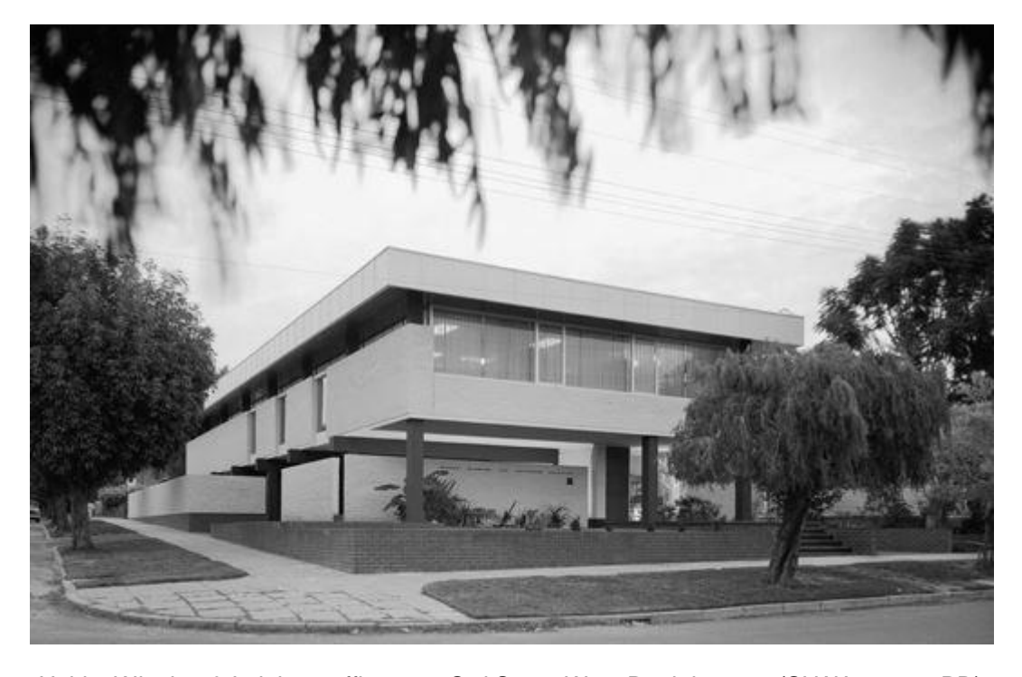
Hobbs Winning & Leighton offices, 37 Ord Street West Perth in 1966