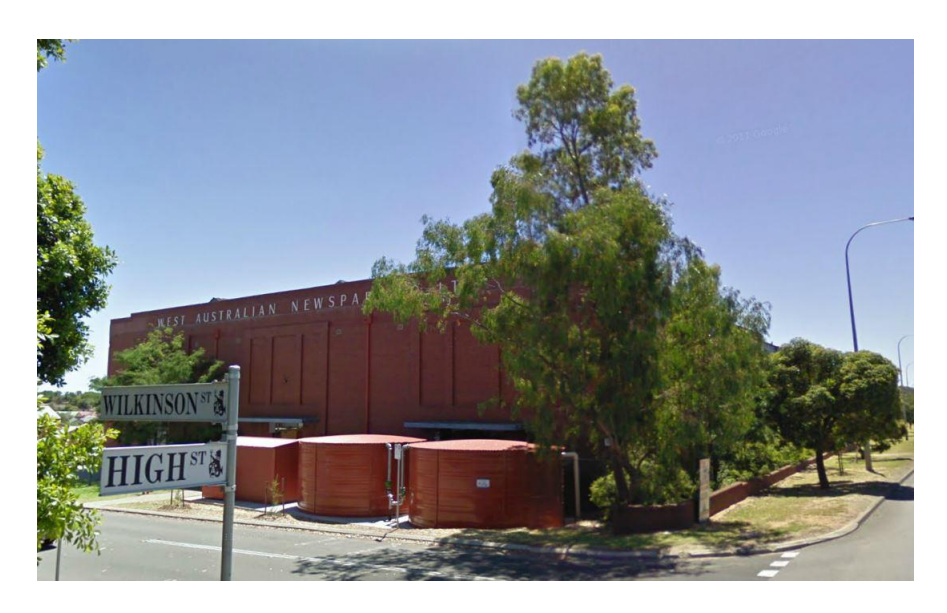
West Australian Newspapers newsprint warehouse, High Street Fremantle 1939.