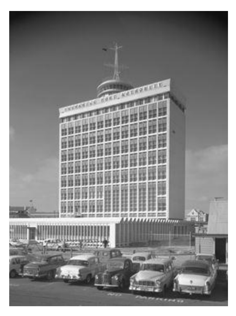
Fremantle Port Authority Building 1964.