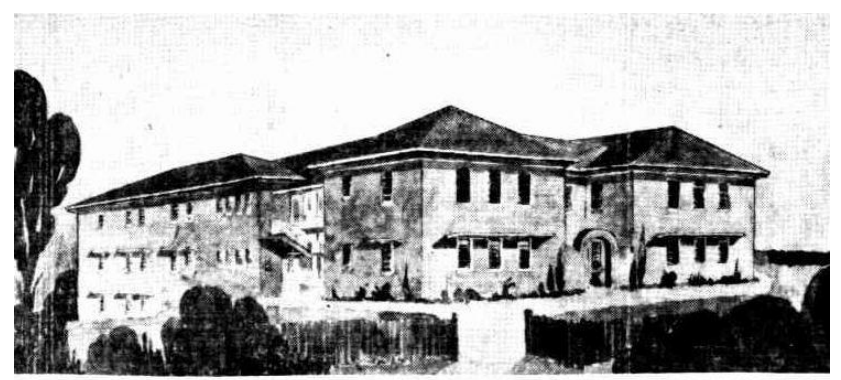
Perspective drawing of a nurses' hostel to be erected in Spring-street, Perth. It will be leased by the diocesan trustees of the Church of England to the Mount Hospital. The architects (Messrs. Hobbs and Winning) invite

Nurses Hostel for Spring Street, Perth (The West Australian, 10 June 1939, p.8).